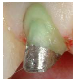
Broken down tooth built up with a metal post and amalgam core