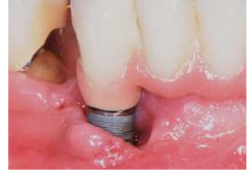
Exposed implant due to gum and bone loss

Both untreated and unsuccessfully treated peri-implantitis may lead to pain, a bad taste and increasing implant mobility. Eventually the implant, as well as teeth adjacent to the implant, may be lost. As well, significant bone loss around the implant jeopardizes the success of a new implant in the same site.