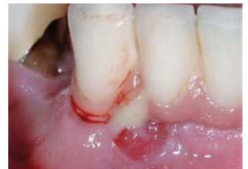
Suppuration around implant