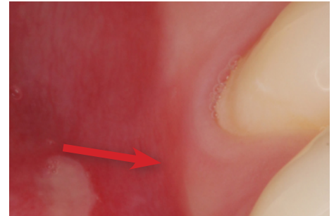
Canker Sore or “Aphthous Ulcer”

If the ulcer is the result of a disease process, it may worsen if left untreated. If it is caused by ongoing trauma, it may also worsen with time. In the rare event that it is cancer, it can lead to disfigurement or death if not diagnosed and treated in a timely manner.