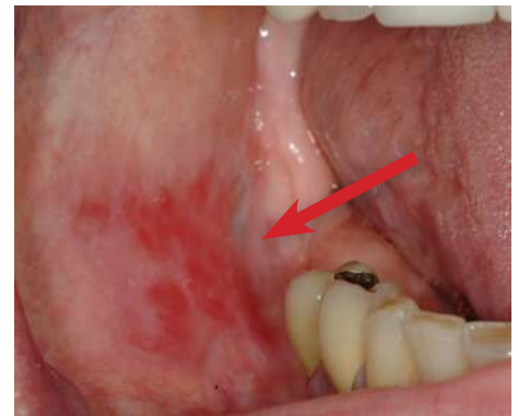
Red Ulcer (Erosive Lichen Planus)